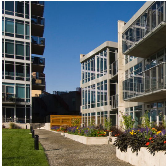
The Park at ONE Riverfront