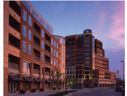
Park Place & Riverfront Tower