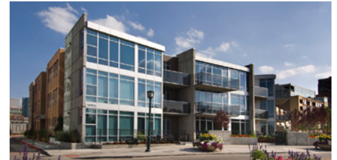
The Park at ONE Riverfront